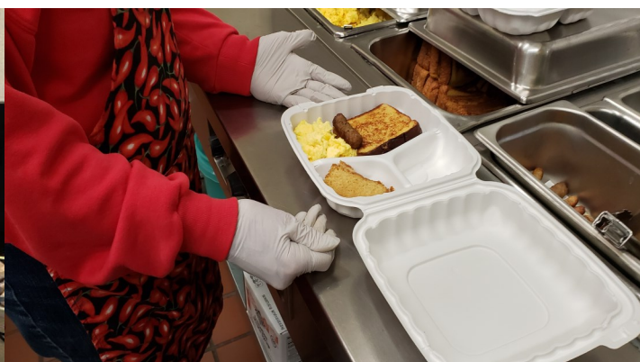
Serving a Take Out Breakfast