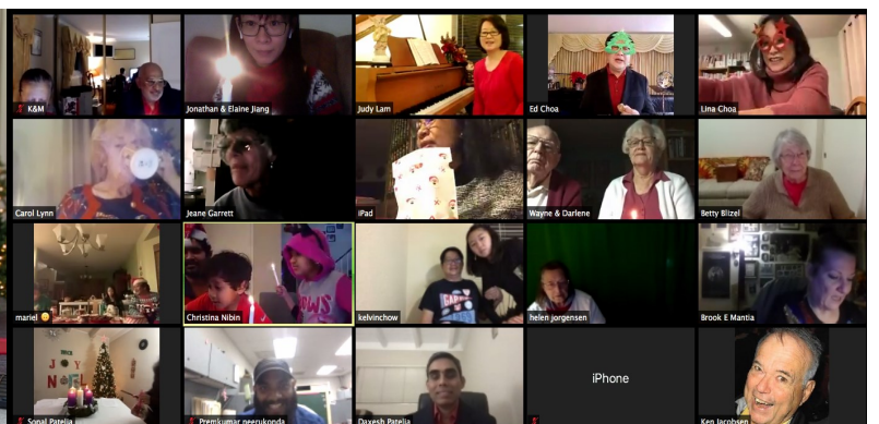
Christmas Eve Service