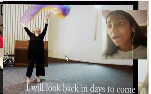
Liturgical Dance at Worship