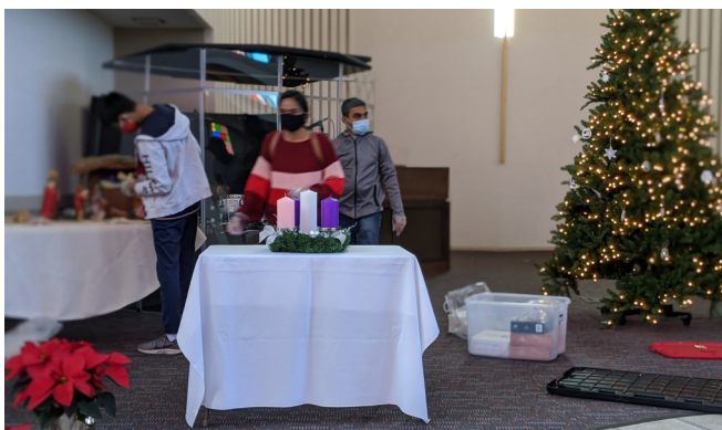
Hanging of the Greens