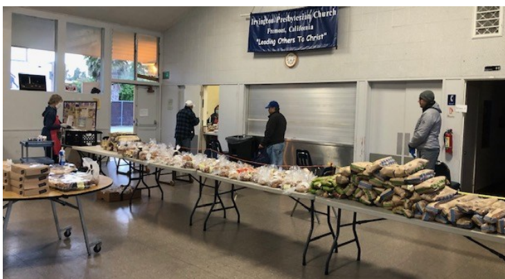
Social Distancing while Waiting for Breakfast