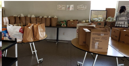
Grocery Bags Ready for Distribution