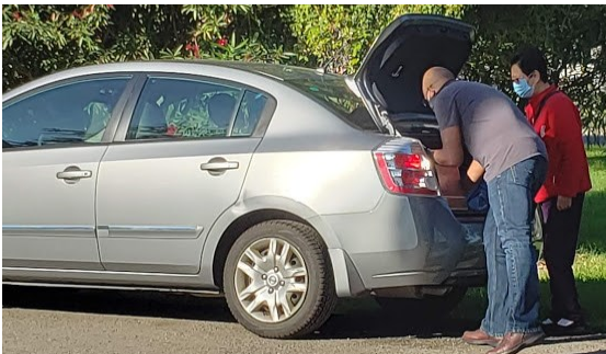
Loading Groceries in Car Trunk