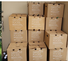
USDA Food Boxes