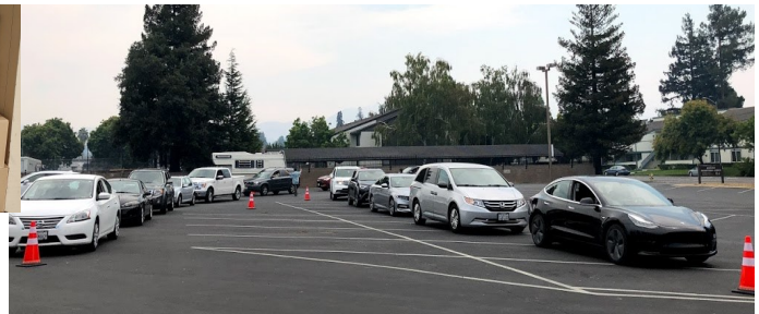
Vehicles at the Drive Thru Tamale Festival