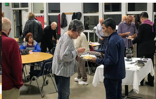
Communion on Ash Wednesday