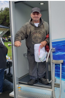
Serving the Unhoused