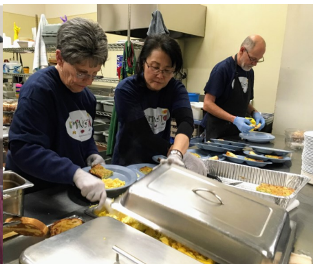
Preparing Dinner for Meeting