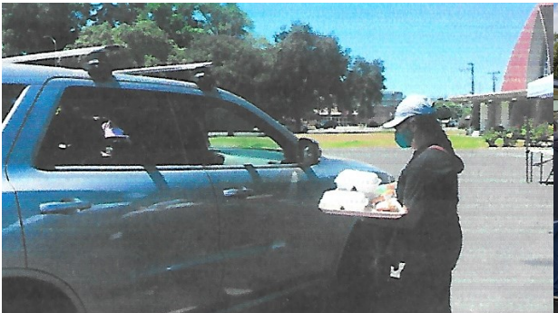
Bringing Picnic Boxes to the Cars