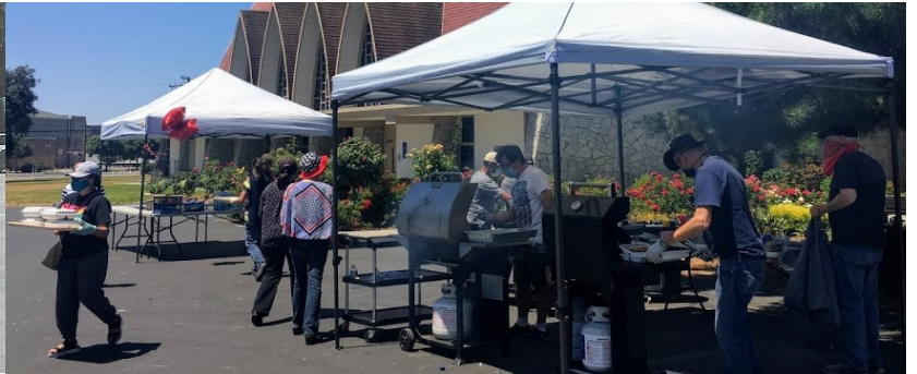
Grilling and Preparing