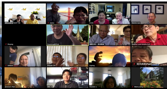
Fule Church Worshipping On Line