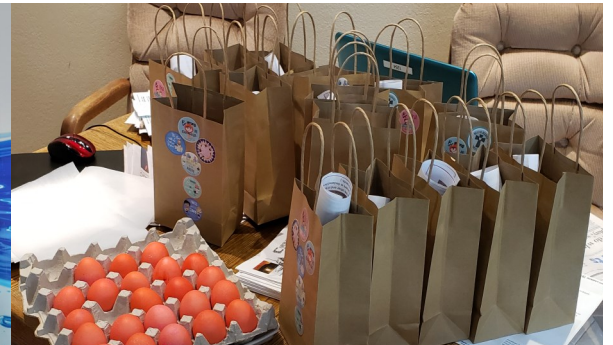
Preparing and Bagging Easter Red Eggs