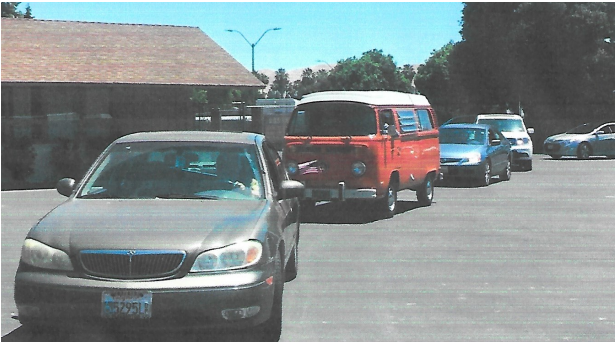
4th of July Drive Thru Picnic