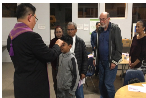
Ash Wednesday Service