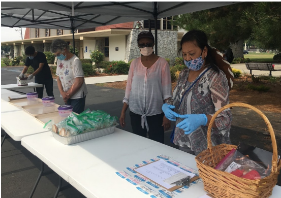
Preparing for Tamale Festival