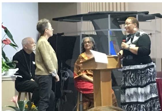
Hosting Presbytery Meeting

Join us in thanking the Lord for an unusual and exciting year at IPC.