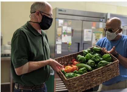
Farmington Produce for TCFBP