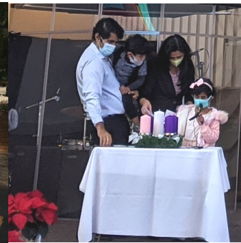
Lighting the Candle of Hope