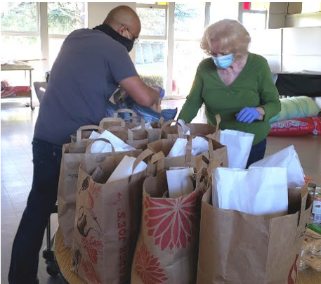
Packing Groceries for Pantry