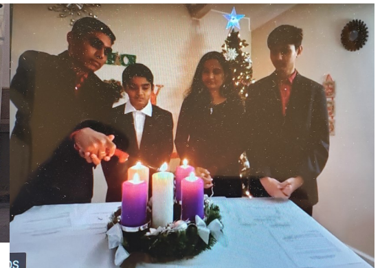
Lighting the Christ Candle