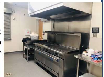
Serving in a New Location

Thanks to quick work by Kimmie in the Breakfast Program, a new home at a local church that did not need both ovens, was found for the old unit. So rather than going into the landfill, this unit has now been set up to faithfully serve another church congregation in the Fremont area.