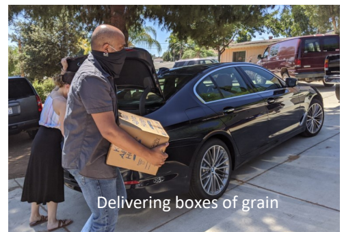
Delivering boxes of grain

Christian Ministry for at risk, abandoned, and special needs Mexican children. This is a ministry that IPC has been helping to support for over 15 years.