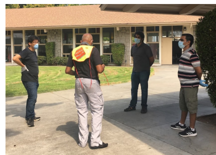
Last Minute Instructions