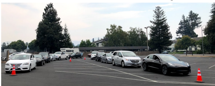
Vehicles Lining up in the Parking Lot

With over 54 members, families and guests in attendance, IPC celebrated our August 22 Tamale Drive Thru and communion with amazing success. All in attendance wore masks, practiced social