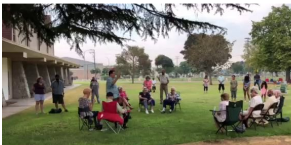
Communion and Prayer