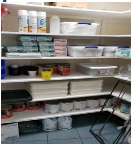
A Full Pantry

Most of you are aware that the landmark Clover Leaf Family Bowl that opened in Fremont in 1959, 61 years ago, recently decided to cease operations. The Tri City Free Breakfast Program was the recipient of several hundred dollars worth of condiments, gloves, non perishable foods and cleaning supplies that Clover Leaf restaurant was no longer able to use.