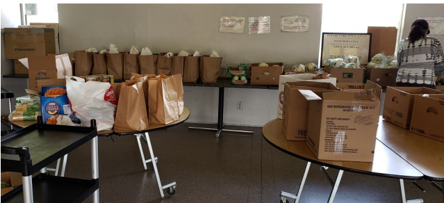
Packing bags with groceries for the Pantry

The drive thru pantry now distributes 36 bags of groceries each week. Each bag contains eggs, pasta, sauce, bread, rice, canned beans, canned meat, fruit and vegetables. For six weeks fresh produce from Farmington, our community garden, were a big hit! The Presbytery of San Francisco gave an initial $2K grant for purchasing protein. Additional contributions from church members and community friends, help support the pantry.