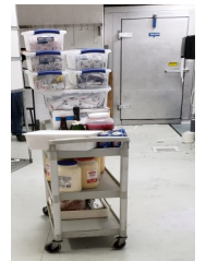
Loading up a Cart