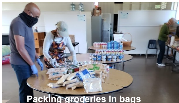
Packing groceries in bags