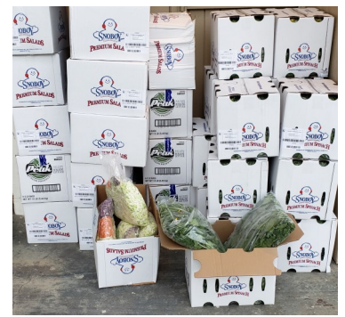
From Peninsula Food Runners