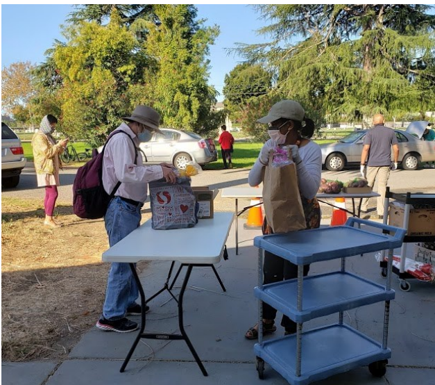
Distributing bags with groceries