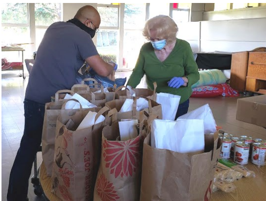
Packing bags with groceries

The drive thru pantry now distributes 40+ bags of groceries each week. Each bag contains eggs, pasta, sauce, bread, rice, canned beans, canned meat, fruit and vegetables. For six weeks fresh produce from Farmington, our community garden, were a big hit! The Presbytery of San Francisco