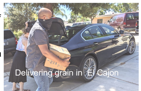
Delivering grain in El Cajon

Outreach Ministry has teamed up with the local chapter of KIDS AGAINST HUNGER to bring food packets of fortified grain to seniors and the unhoused in the local community. This fortified grain is also added to the grocery bags of guests who come to the drive thru pantry. In addition, we delivered two boxes each with 36 packs of fortified grain to Rancho Santa Marta, at their local US office in El Cajon, CA. Rancho Santa Marta is a non-denominational Evangelical Christian Ministry for at risk, abandoned and special needs Mexican children.