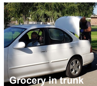
Grocery in trunk

As the cars come through the drive thru, the drivers are asked to pop their trunks and volunteers deliver bags with food to the vehicle without any contact required. Those who ride bicycles or walk up to the pantry receive the same care and grocery bags as everyone else. As the number of people coming to the food pantry continue to increase, Outreach Ministry is actively seeking additional funding and stable food sources to continue this program.