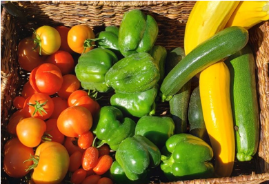
Produce for the Pantry

We are now well into fall and activities are winding down. Despite COVID –19 and the late start, we reaped over 300 ears of corn, 200 lb of tomatoes, 240 lb of zucchini, 80 lb of peppers, and 20 lb of beans. All of the produce were distributed at the drive thru pantry and some given to the breakfast program.