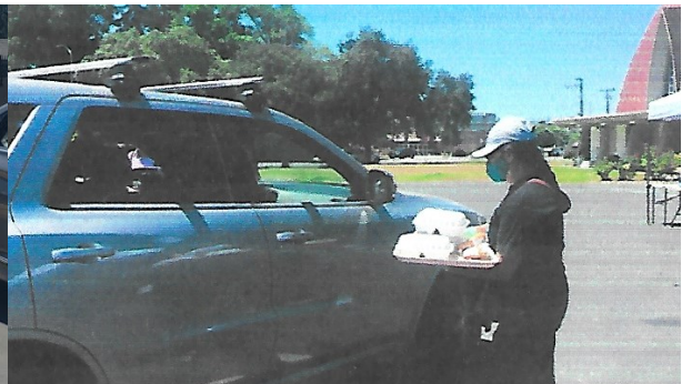
Serving Picnic Boxes