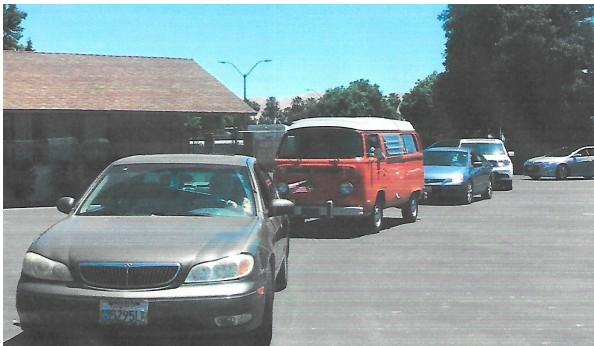
Vehicles in the Drive Thru