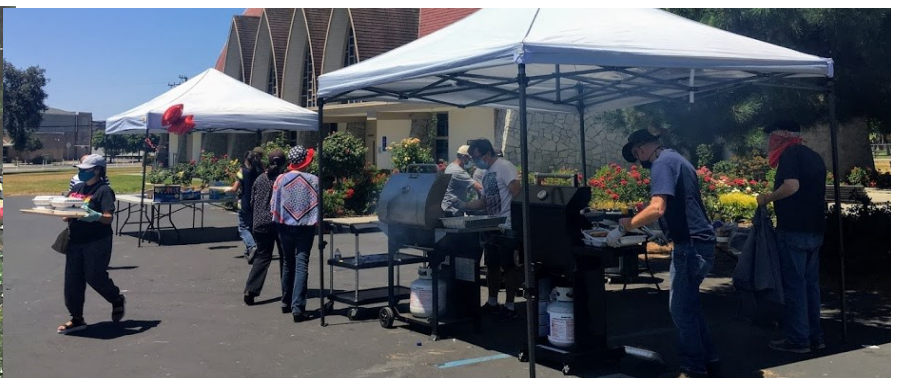
Grilling and Preparing