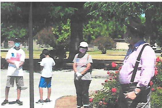
Opening in Prayer