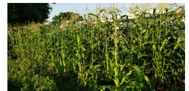
Corn, ready for reaping

Each Saturday when guests come to the Food Pantry, fresh vegetables from Farmington are added to the bags. For the week ending August 23, we distributed about 20 lb of tomatoes, 25 lb of zucchini and 12 lb of bell peppers to the guests.