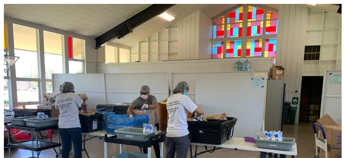
Packing grain packets in the social hall

Outreach Ministry has teamed up with the local chapter of KIDS AGAINST HUNGER (KAH) to bring food packets of fortified grain to seniors and the unhoused in the local community. Recently we have expanded this program to bring the same to organizations in need. Each packet of grain will feed up to six people. The packets are now filled and boxed in the social hall by KAH volunteers and are shipped from IPC to Rancho Santa Marta in Mexico, a school for the blind in the Philippines and soon to Hope Unlimited in Brazil. The KAH local chapter also serves Haiti, El Salvador as well as local school districts in Manteca and Modesto.