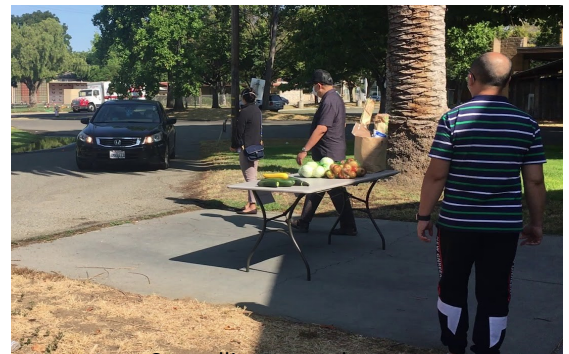
Car pulling up to the pantry

The first drive thru started on July 11, and food distribution has now grown to 20+ bags of groceries. We have pasta, sauce, bread, rice, canned beans, canned meat, fruit and vegetables. Thanks to cash donations from our members and the Presbytery of San Francisco, we have added one dozen eggs to each bag. Fresh produce from Farmington, our community garden, are a big hit! The Presbytery of San Francisco provided a $2K grant for purchase of additional protein that are bring added to the groceries distributed.