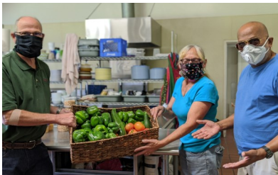
From Farmington to the Breakfast

Farmington, our Community Garden continues to produce tomatoes, zucchini and corn.