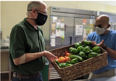
Delivering produce to TCFBP

Farmington, our community garden is producing. We have tomatoes,