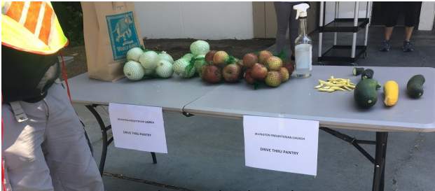
Some produce at the drive thru pantry

On Saturday July 11, IPC launched a Drive Thru Food Pantry. Plans are to have