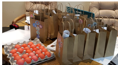
Preparing and bagging Red Eggs

Easter Sunday was a special challenge in trying to maintain our traditions. Rather than the customary Easter Egg Hunt, we prepared "red eggs" and delivered to members and friends. These Easter eggs were dyed red to represent the blood of Christ, shed on the cross, and the hard shell of the egg symbolized the sealed Tomb of Christ. During Sunday Worship, we cracked the eggs to symbolize the resurrection of Christ.