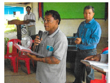
Two gifted Cambodian pastors