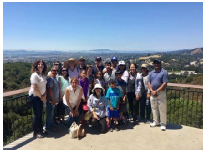
Top of the mountain at Oakland Zoo gondola ride.