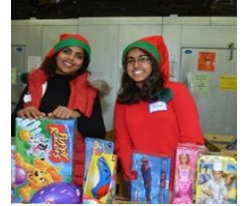
Children's Toy Christmas Party