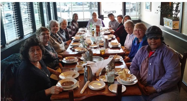
Fellowship at the Olive Garden in January

The next "Ladies Out to Lunch" group will meet at Sala Thai Restaurant: