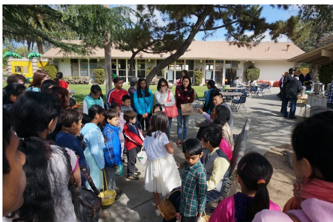
Easter Festivities on 27 March 2016