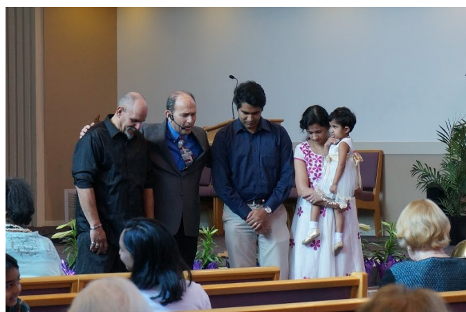
IPC New Members on 27 March 2016