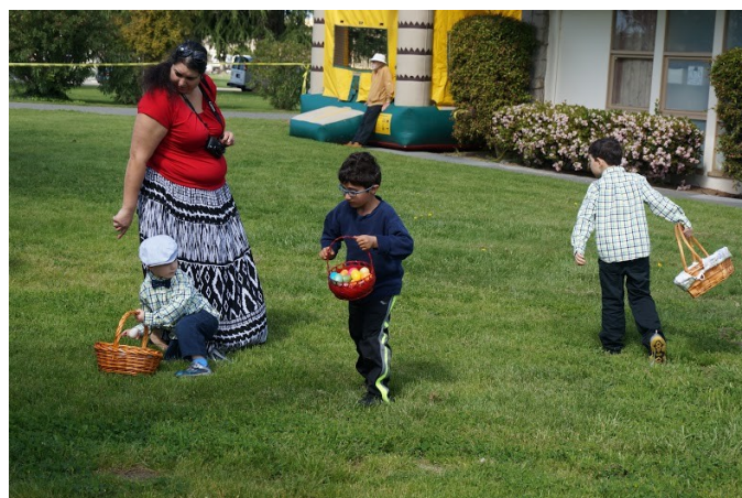
Easter Festivities on 27 March 2016