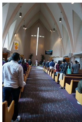
Easter Service on 27 March 2016