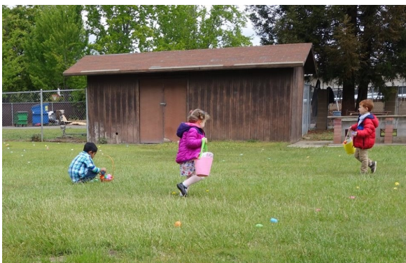
Easter Egg Hunt 2015 Where are the eggs?????