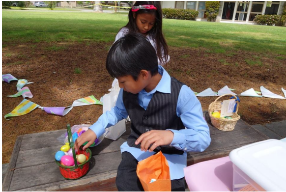
Easter Egg Hunt 2015 Can we eat some candy?????