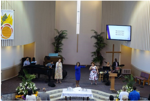
Our Praise Group on Easter Sunday 2015 He is ALIVE!