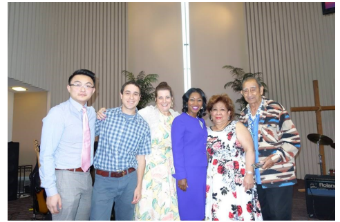
Our Praise Group on Easter Sunday 2015 He is ALIVE!