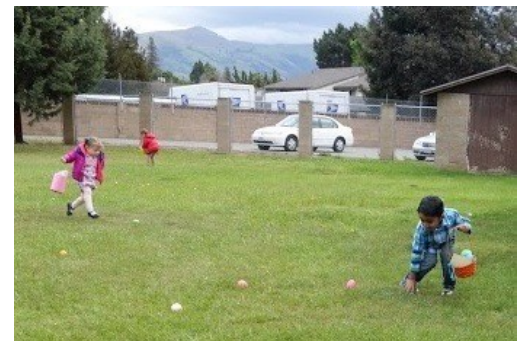
Easter Egg Hunt 2015 Oh, hit the jackpot here!